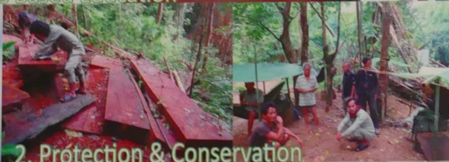
2. Protection & Conservation