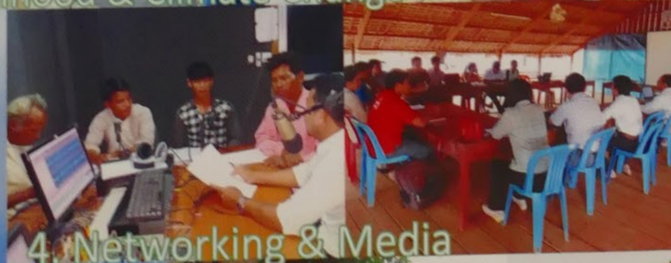
4. Networking & Media