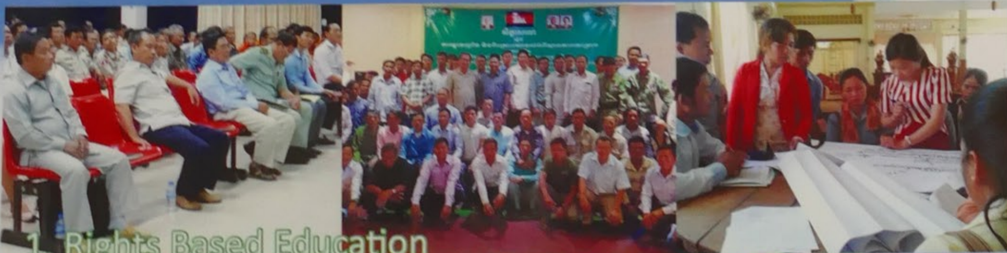
1. Rights Based Education

*NRM = Natural Resource Management, NTFP = Non-Timber Forest Products, RBA = Rights Based Approaches