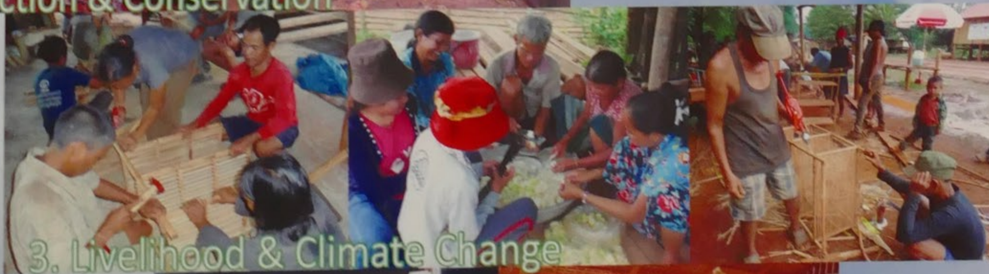
3. Livelihood & Climate Change